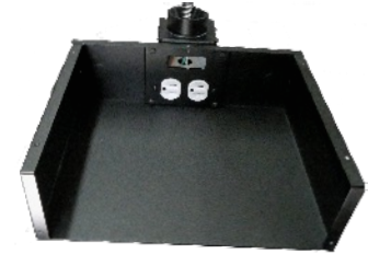
Pole Mount Version Junior Plenum Equipment Enclosure