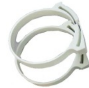
(4) Flexible Hose Clips