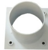
(2) Inlet /Exhaust Plenum Box Tubes