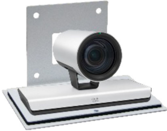
Cisco Anti-Vibration Platform size allows it to fit any Cisco Style Camera that uses a 1/4".20 Tripod Screw.

The Camera sits on a Platform supported by an Anti-Vibration Gasket that assists with the Back Plate Gasket in providing the necessary level of Vibration absorption