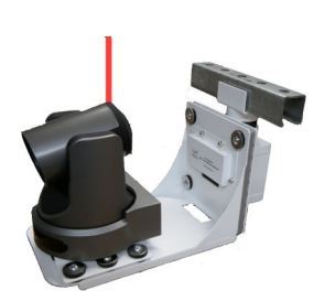
NB-AVCB-W and NB-PMA-W

Black Back Plate shown with Pole Mounting Adaptor fitted